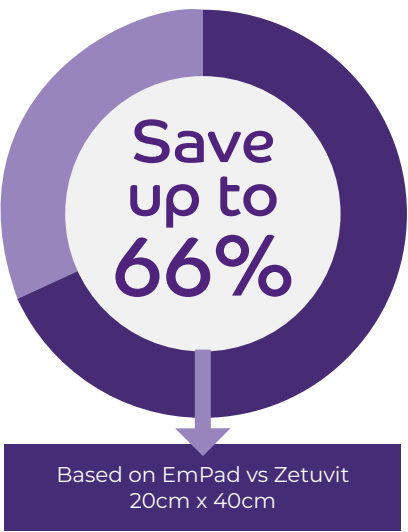
EmPad Price Saving Vs Other Popular Brands